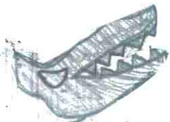
Skull of Ichthyosaur